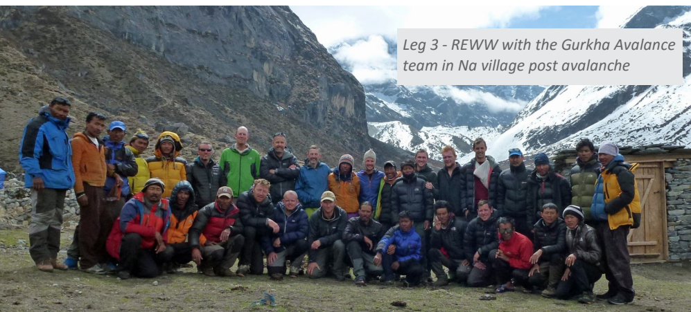
Leg 3 - REWW with the Gurkha Avalance team in Na village post avalanche

The day we crossed the high passes we set off at 2am and were on the move for nearly 20hrs. We crossed deep snow and proceeded to do a 100m abseil down an ice wall in crampons – certainly an experience to remember.