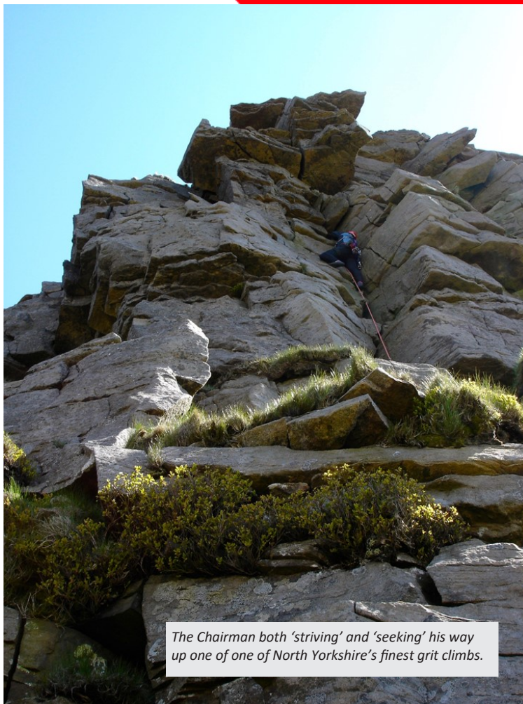
The Chairman both 'striving' and 'seeking' his way up one of one of North Yorkshire's finest grit climbs.

Activities over the last 6 months have focused on increasing our fund raising capacity and putting plans in-place for our 25 th anniversary next year. Both strands have occupied a significant amount of Trustees' time – for which I am most grateful. There is little doubt that the Trust is moving forward in a very positive manner. Indeed, to assist, we have brought in several charity experts to help us, who have not only endorsed our work to date but have recommended some particularly useful next steps.