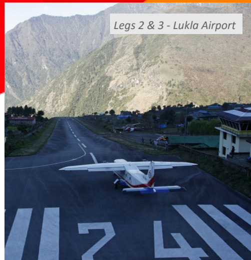
Legs 2 & 3 - Lukla Airport

At around 1200 the earthquake struck Nepal which triggered an avalanche engulfing the entire group and sweeping away all equipment. It consisted of mainly hard rock and ice as opposed to powder and it was soon found that 2 of the Gurkha Adventures support team had been killed and there were a further 4 British and 4 Nepalese casualties. The injuries included head wounds, a dislocated shoulder, suspected broken ribs and shock. After liaison with the helicopter company and attempting to contact the Embassy the scale of disaster that had engulfed Nepal became clear and the team realised it may be some time before they were rescued. The decision was taken to walk to the nearest village, Na, as despite having casualties the concern was an aftershock might trigger a second avalanche. The walk to Na was extremely strenuous as there was little food and water and the majority of kit had been lost. After a further 10hrs walking the small settlement was reached where the team stayed for the next 72hrs before being evacuated to Kathmandu by helicopter.