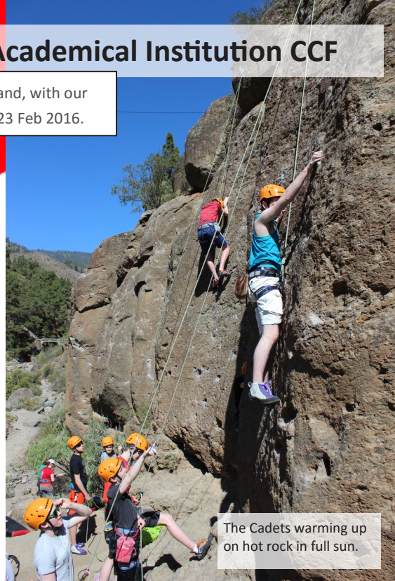
The Cadets warming up on hot rock in full sun.

and a vicious four-foot overhang, no-one completed this, but it was extremely enjoyable; especially when swinging out from the rock after ping-pong. We decided a few easier climbs would be the way forward and a way to keep spirits up. There were a few other climbs which were slightly easier as they did not have the overhang.