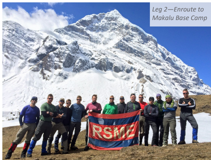
Leg 2—Enroute to Makalu Base Camp

"To strive, to seek, to find, and not to yield"